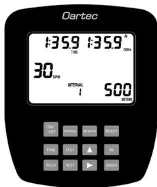
Split Interval 1

Press the ARROW buttons to move from the F screen to the Splits that show the results for each split segment. In this case every 500m. ( See Setting the Splits)