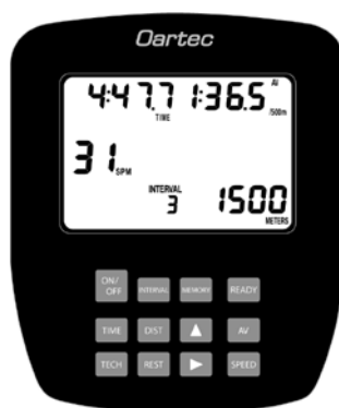
Split Interval 3