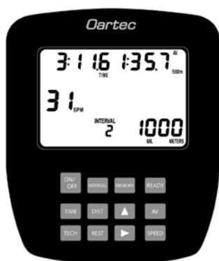
Split Interval 2