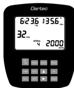
Split Interval 4